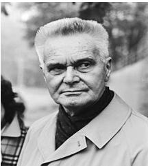
Jan Tinbergen Nobel Prize in Economic Sciences-1969