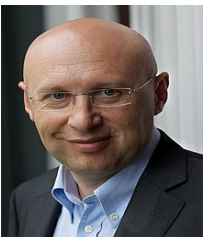
Stefan W. Hell Nobel Prize in Chemistry – 2014