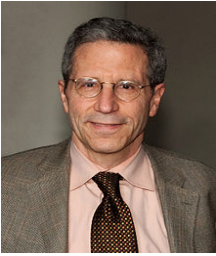
Eric Maskin Nobel Prize in Economic Sciences – 2007