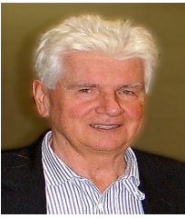
Günter Blobel Nobel Prize in Physiology – 1999