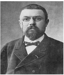
Henri Poincaré Famous mathematician, well known for Poincare conjecture