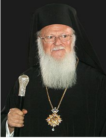
Bartholomew I of Constantinople, the Ecumenical Patriarch