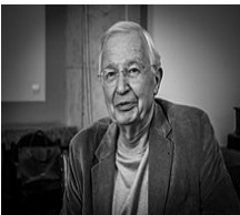
Jean-Marie Lehn Nobel Prize in Chemistry – 1987