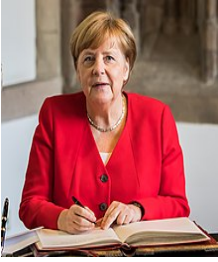
Angela Merkel, German Chancellor