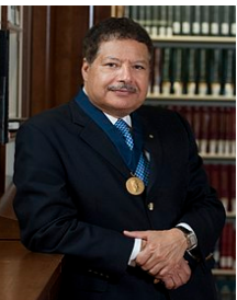
Ahmed Zewail Nobel prize in Chemistry – 1999