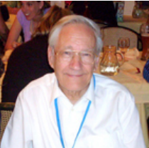
Richard Ernst Nobel Prize in Chemistry – 1991