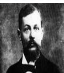
Emmanuel de Martonne A leading international geographer, one of the founding fathers of geomorphology