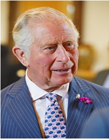
Charles, Prince of Wales