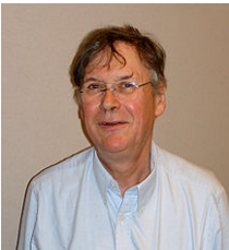
Sir Richard Timothy Hunt Nobel Prize in Physiology – 2001