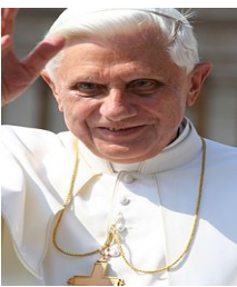
Joseph Ratzinger, Pope Benedict XVI